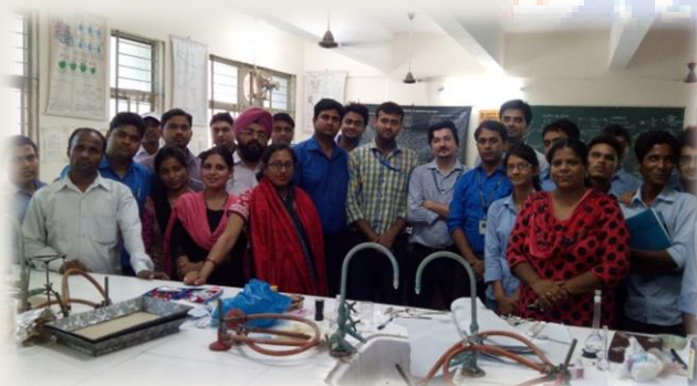
PowerLab Specialists with Faculty and all students of Anand College of Pharmacy