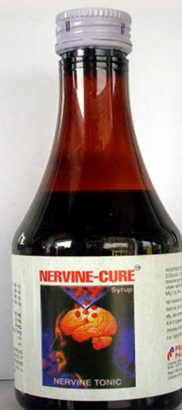
Nervine Tonic (Ayurvedic Proprietary Medicine)