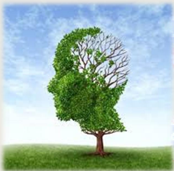
A Grpahical Re-presentation of Mind with Stress