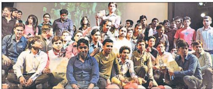
विदाई समारोह में मौजूद आनंद कॉलेज ऑफ फार्मेसी की छात्र ।