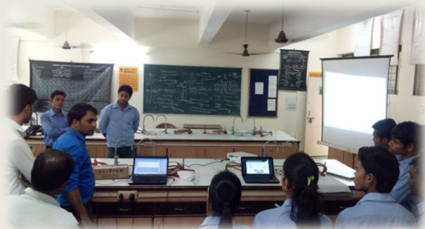
Demonstration of working of PowerLab