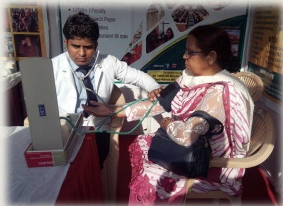
A Student Checking BP of Visitor