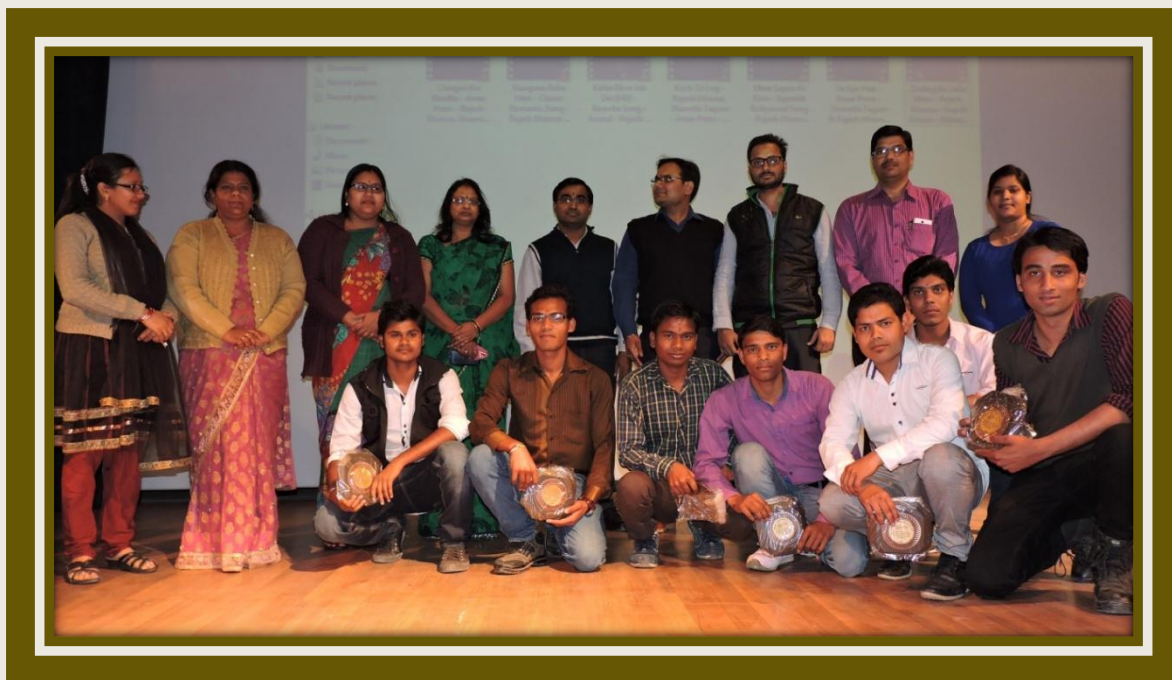
Group Photograph of B.Pharm Final Year students with Faculties