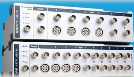
Power Lab Overview