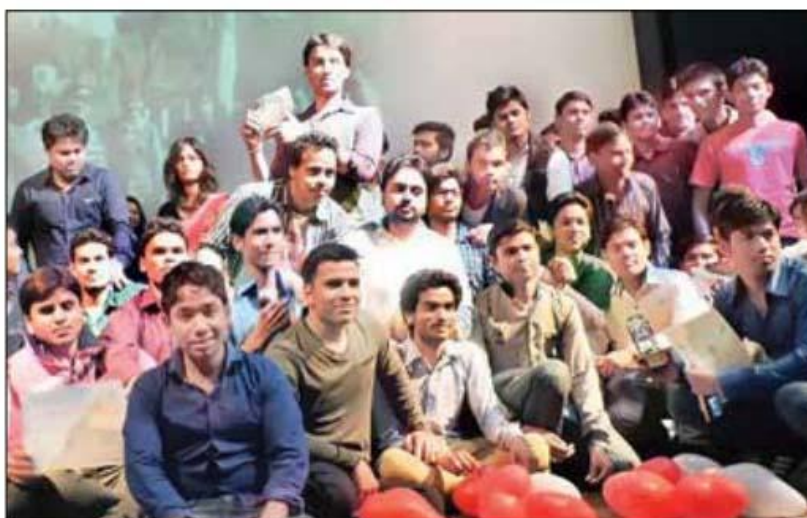
आनंद इंजीनियरिंग कॉलेज ऑफ फार्मेसी के विदाई समारोह में मौजूद छात्र-छात्राएं।