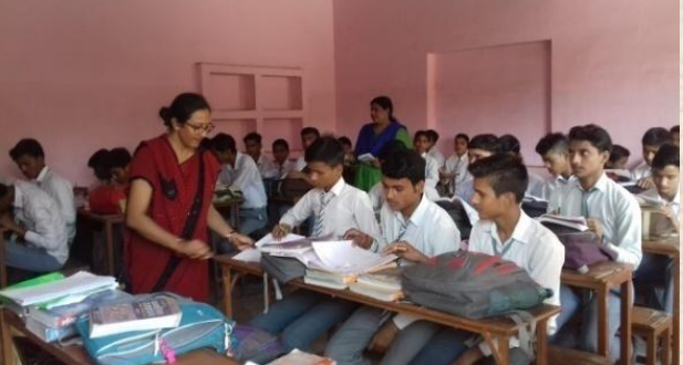
JSL Boys Inter College, Chalesar, Agra