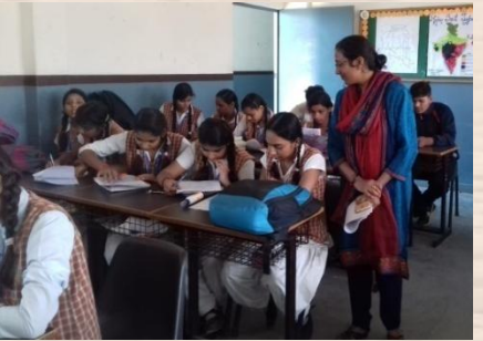
Shri R S Public School, Agra