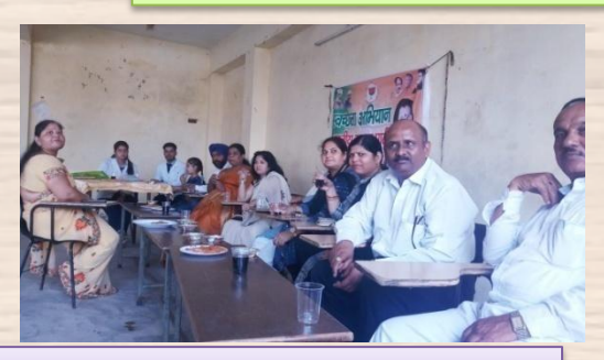
B M Inter College, Sikandra, Agra