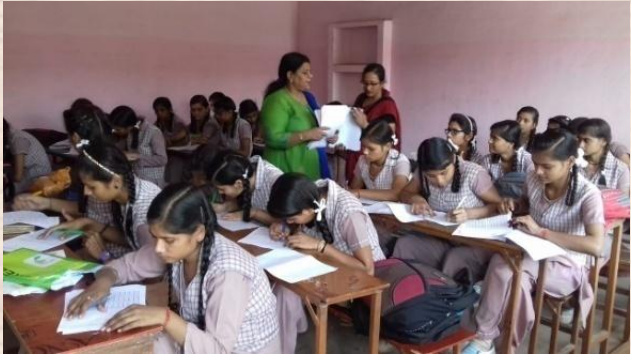
Avantibai Girls Inter College, Chalesar, Agra