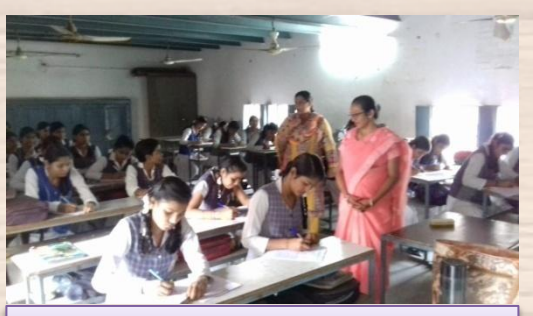
Narayani Girls Inter College, Agra