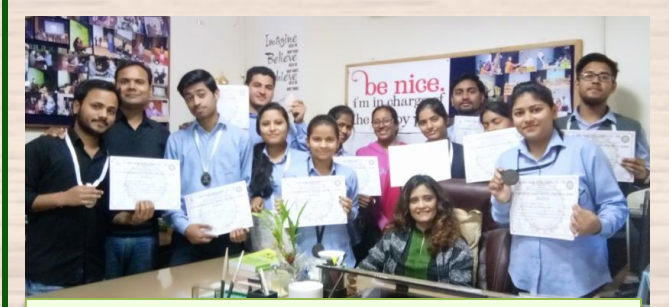
ACP won 4 medals in AKTU Zonal Cultural Fest 2018